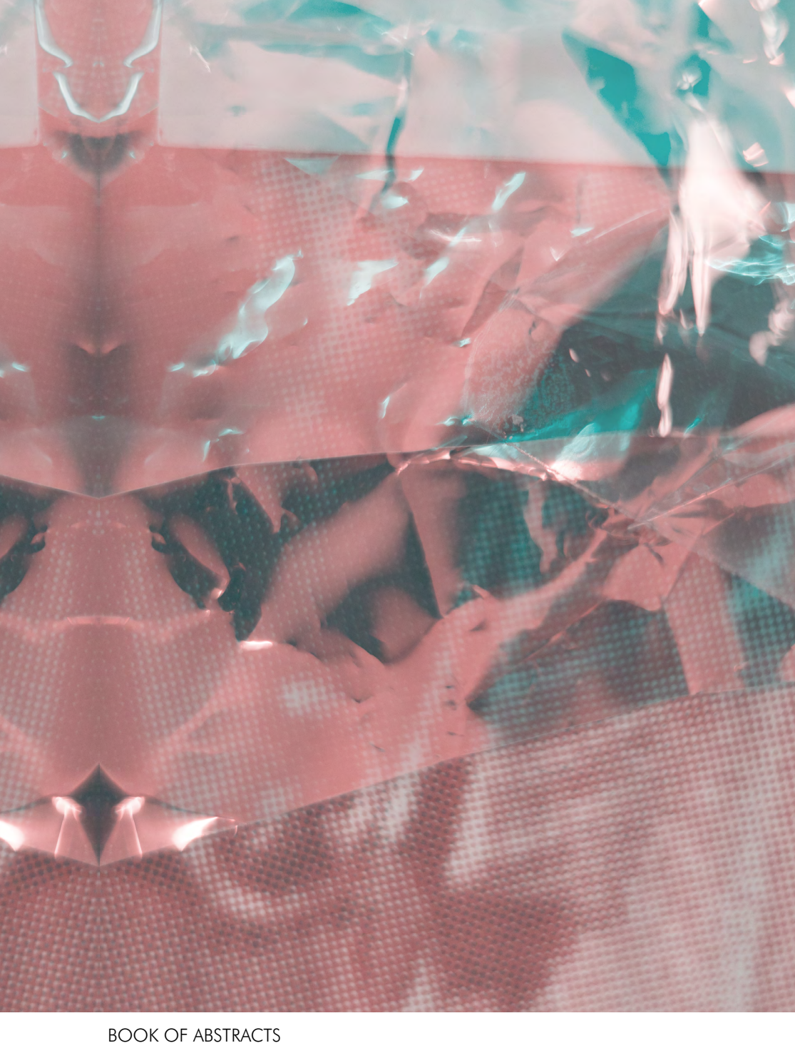
10th European Feminist Research Conference Difference, Diversity, Diffraction: Confronting Hegemonies and Dispossessions